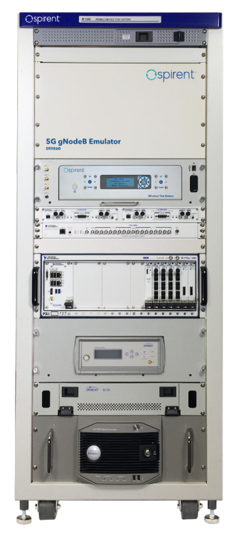
8100 5G location test system