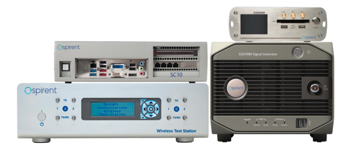
Q750 configuration with optional record and playback unit